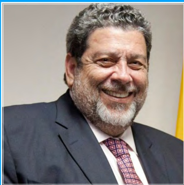
Hon. Dr. Ralph E. Gonsalves Prime Minister

“During the last 10 years, the FSA has made two principal contributions to the Vincentian economy. It has promoted macroeconomic stability and safeguarded the soundness and integrity of our financial system”